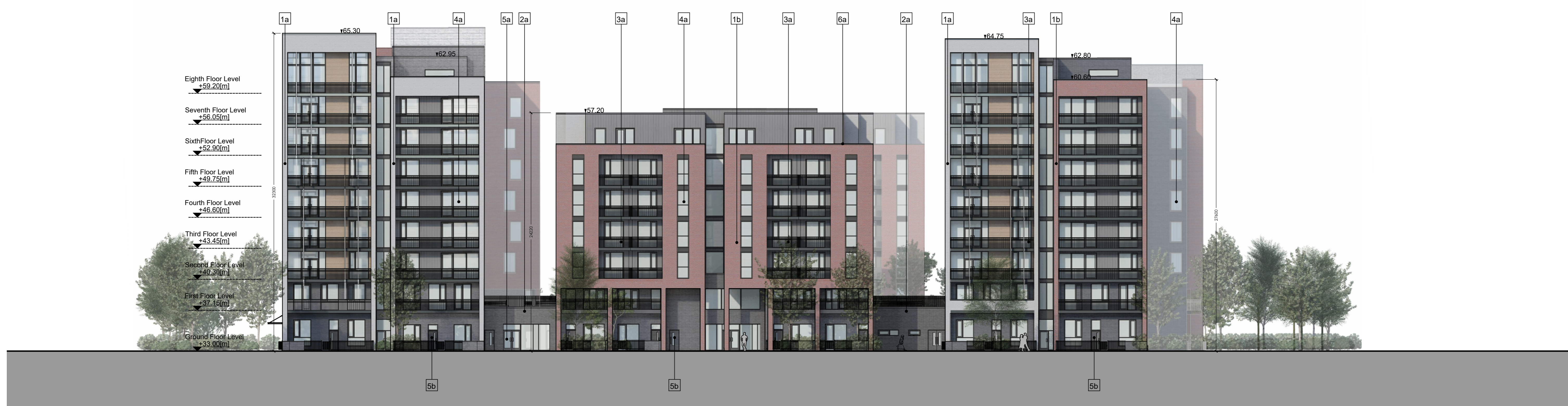
03 - South Elevation - Block 3 Scale 1:200 @A0