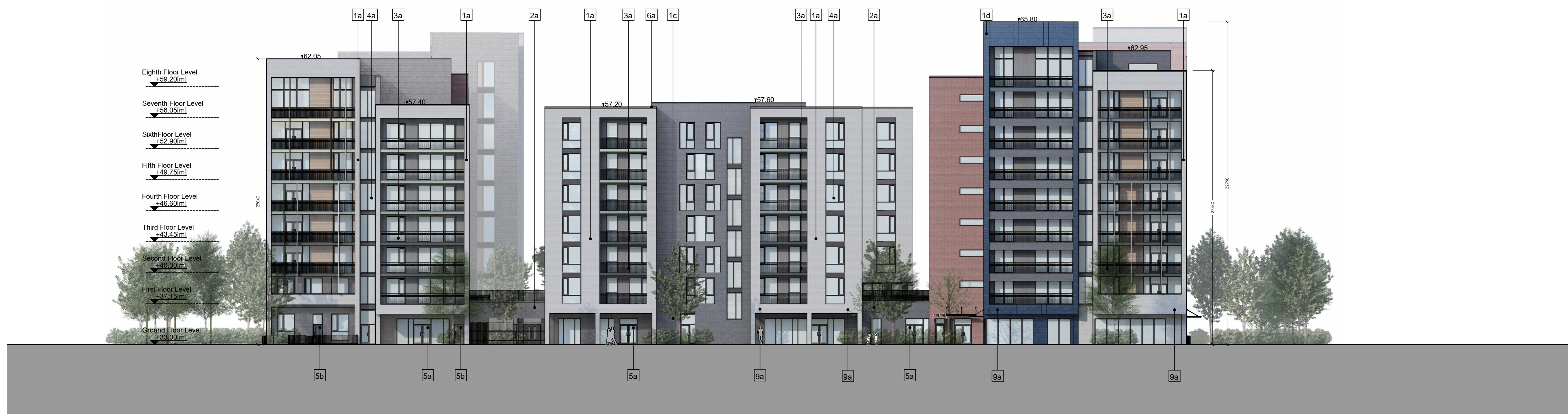
02 - North Elevation - Block 3 Scale 1:200 @A0

Note: 1.8mm high glass balustrade can be provided on the upper level balconies if required by the Planning Authority.