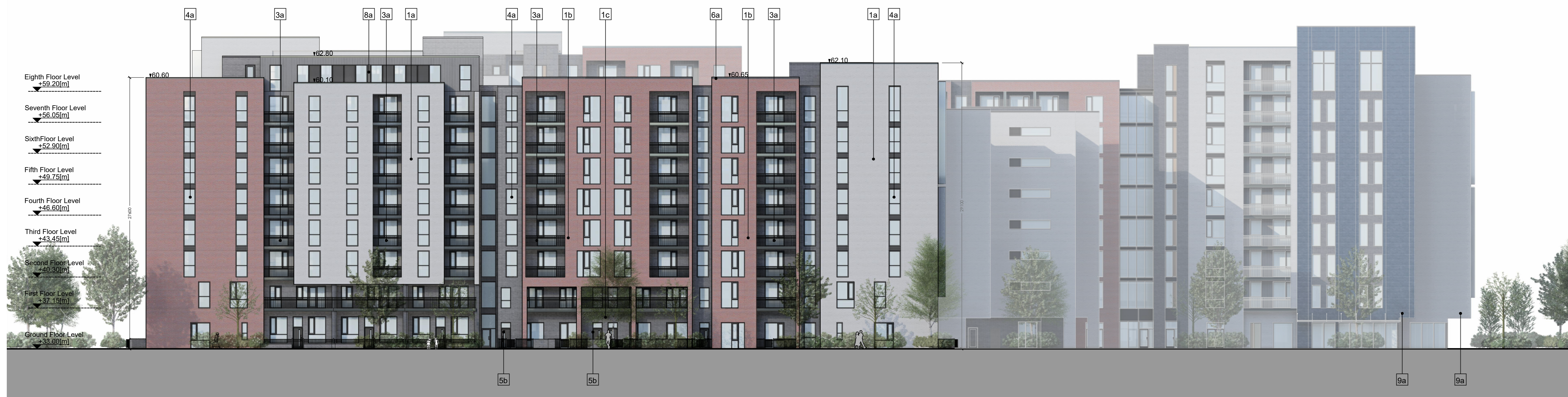
01 - East Elevation - Block 3 Scale 1:200 @A0